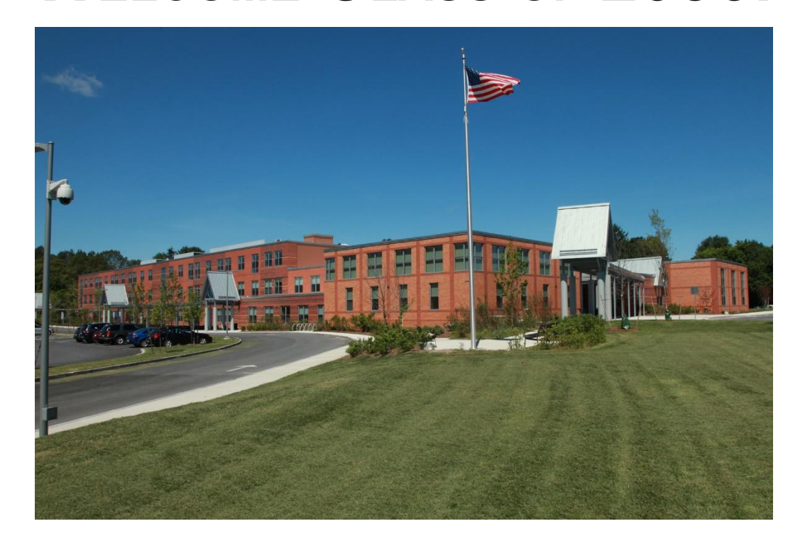
Francis T. Bresnahan School Kindergarten Information Night February 8, 2023